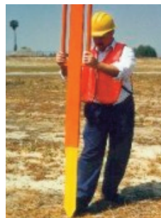
Installs in less than 60 seconds using a standard lightweight hand tool.

Fire resistant characteristics of the material withstand small grass fires and controlled ditch burns. Will not soften and melt like plastic markers