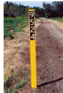
Versatile applications include 9-1-1 rural address markers and campsite identification.